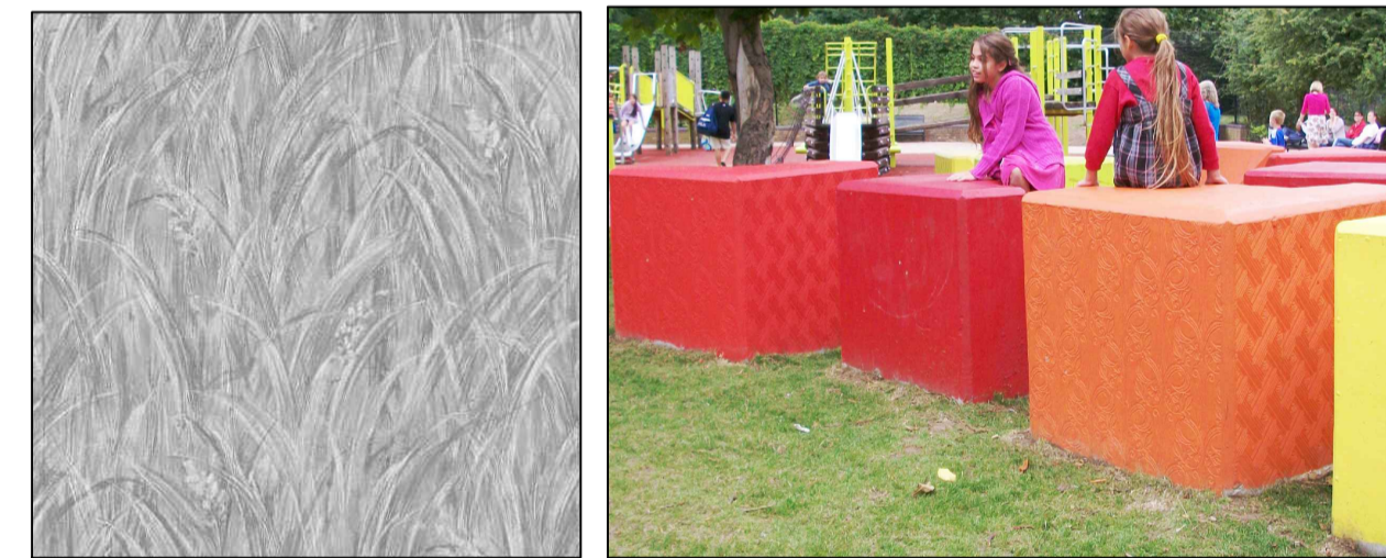
'Grass blown' wall paper pattern to be used on ball court wall. Suggested supplier: Graham & Brown (www.grahambrown.com)